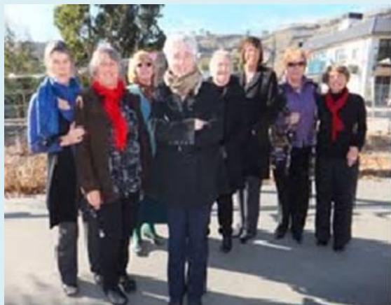
Nat Exec members taking a break and a walk around the devastation in Christchurch.

The highlight for this year was when we all travelled to Christchurch to support our early childhood colleagues in the wake of the 2011 earthquake. A lot of work has been done by the Christchurch chapter to support teachers, children and families as they cope with the aftermath of the earthquake. National Executive was able to demonstrate a commitment to the area and encourage those who are having to face the challenges on a daily basis of disruption in their homes, their workplaces and, the effects of the trauma on children and their families.