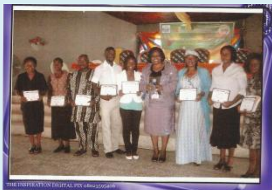
Launching of OMEP certificates

OMEP Nigeria launched her membership certificate and Identification Card for members. All membership are made eligible by coding which is in our Website.