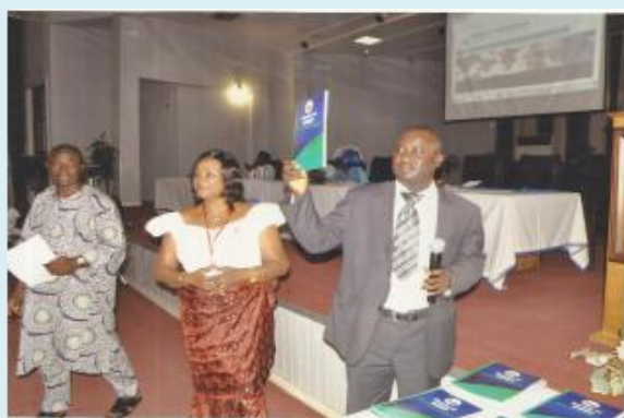
Launching of OMEP journal

We launched a two volume Journal at our last National Conference.