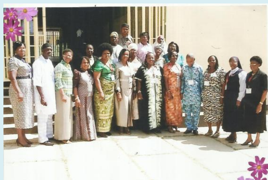
OMEP council at a national conference

OMEP gives back to the Communities by keeping our areas clean and also beautifying RoundABOUTS and Parks.