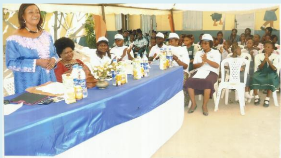
Inauguration of OMEP ABIA chapter

There are a line-up of inaugurations of new Chapters.