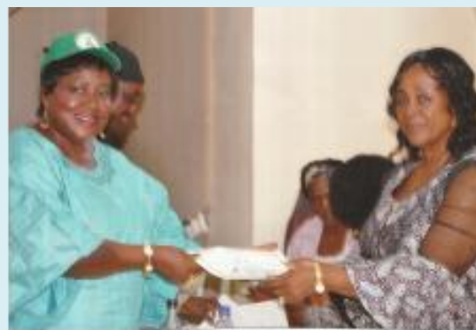
Issuing Certificate at a National Conference

Every State organizes Conferences, Seminars and workshops all the year round. National conference was held in Abuja on the 11th – 14th November 2012 at the National Universities Commission, Maitama, Abuja.