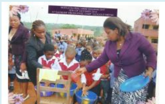
Children at hand washing

15th 2012. A survey of 100 schools were also carried.