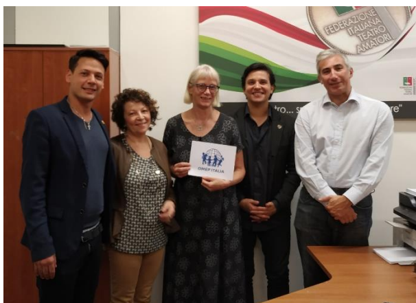
Parts of the OMEP preparatory committee in Rome, in October 2019.

Later, at a committee meeting with OMEP Italy we discussed the role of OMEP and the fact that many OMEP national committees are welcoming Italy back into OMEP. In addition to describing the roots of OMEP Italy, the committee is discussing a possible project for OMEP Italy, as well as considering the world projects.