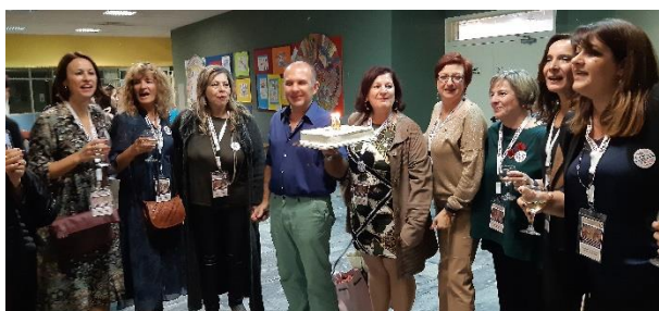
This event was also a celebration, marking the 60 th anniversary of OMEP Greece.

OMEP Greece has successfully organised the 12 th Panhellenic conference on early childhood education. The event took place on 1-3 of November in Patras and in collaboration with the University of Patras.