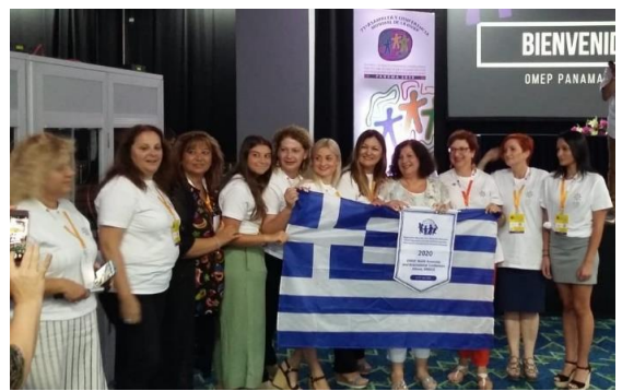
The OMEP Committee and members (photo from 2019)

July 11-12: OMEP World Assembly July 13-15 OMEP World Conference