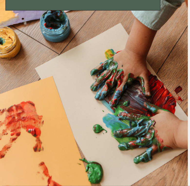
SUSTAINABILITY FROM THE START – ESD FOR ECE – AN ERASMUS+ PROJECT

OMEP Russia has launched an idea about a new project called World Living Heritage. A source of inspiration for teachers and the key to sustainable development. project or not. More information about the project will soon be sent by OMEP Russia